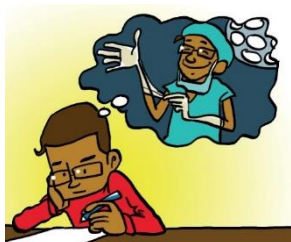
generous / motivated

1 Look at the pictures and choose the correct words.