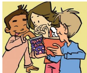
9 artistic / generous