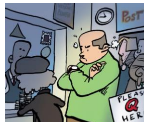
6 impatient / solemn