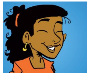
3 cheerful / rude