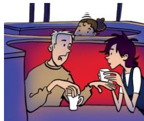
5 motivated / nosy