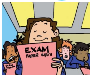
4 impatient / optimistic