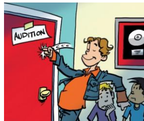
2 nosy / self-assured