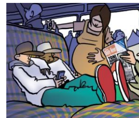
7 rude / silly