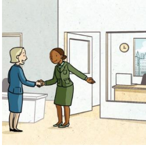
get a promotion

buy a car get a promotion get engaged get your first paycheck go traveling move away from home resign start college