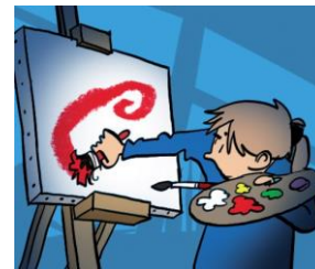
11 artistic / optimistic

2 Complete the sentences with the adjectives in the box.