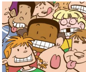
8 self-assured / silly