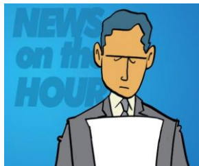
1 self-assured / solemn