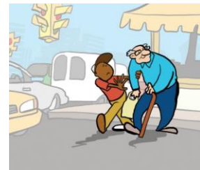
10 cheerful / helpful